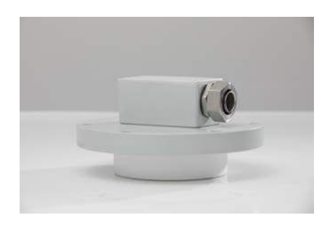
PDU-G1 Internal Window UHF Sensor

In engineering applications, UHF sensors have been widely used to detect defects such as cracks in physical structures, displacement and tilt detection in wireless radio frequency identification systems, and partial discharge measurements in high voltage engineering. These applications are practically feasible because the transient process of these defects have very short rise times, which results in induced frequency components in the UHF range. An UHF sensor plays a significant role in UHF PD measurement because the initial step of PD measurement is to acquire electromagnetic signals using these devices for further signal processing. To this end, the performance of the sensors will dramatically influence the accuracy and sensitivity of the PD detection system.